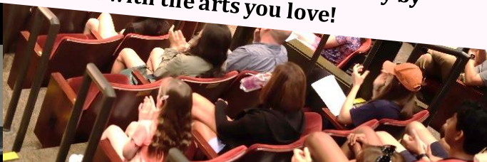
COMPOSITION TRACK - Polished Chamber Music Composition by Intensive Coaching