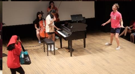
Acting in My Created Music Story