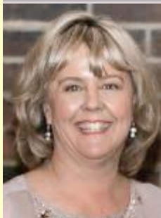
MUSIC DIRECTOR (MD)