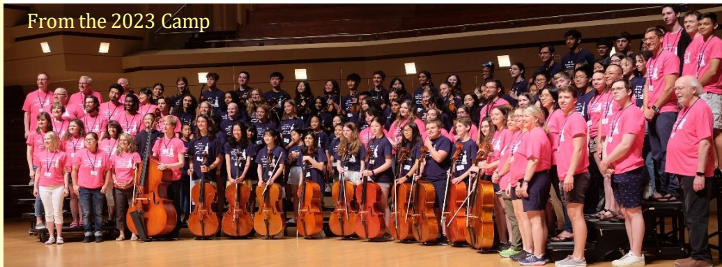
From the 2023 Camp

From a three-year camper who moved out-of-state: Music conservatory going, she will make her debut as the violin soloist performing “ Mother and Child ” by William Grant Still with her residing state’s symphony orchestra in March, 2024. She said, “ OPUS played a very prominent role in me and my family’s musical journey. The three summers that I participated as an OPUS student were unforgettable, having learned lessons that I would not have attained otherwise. ”