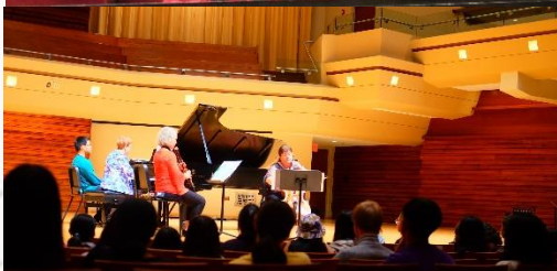
The Orion Ensemble Concert