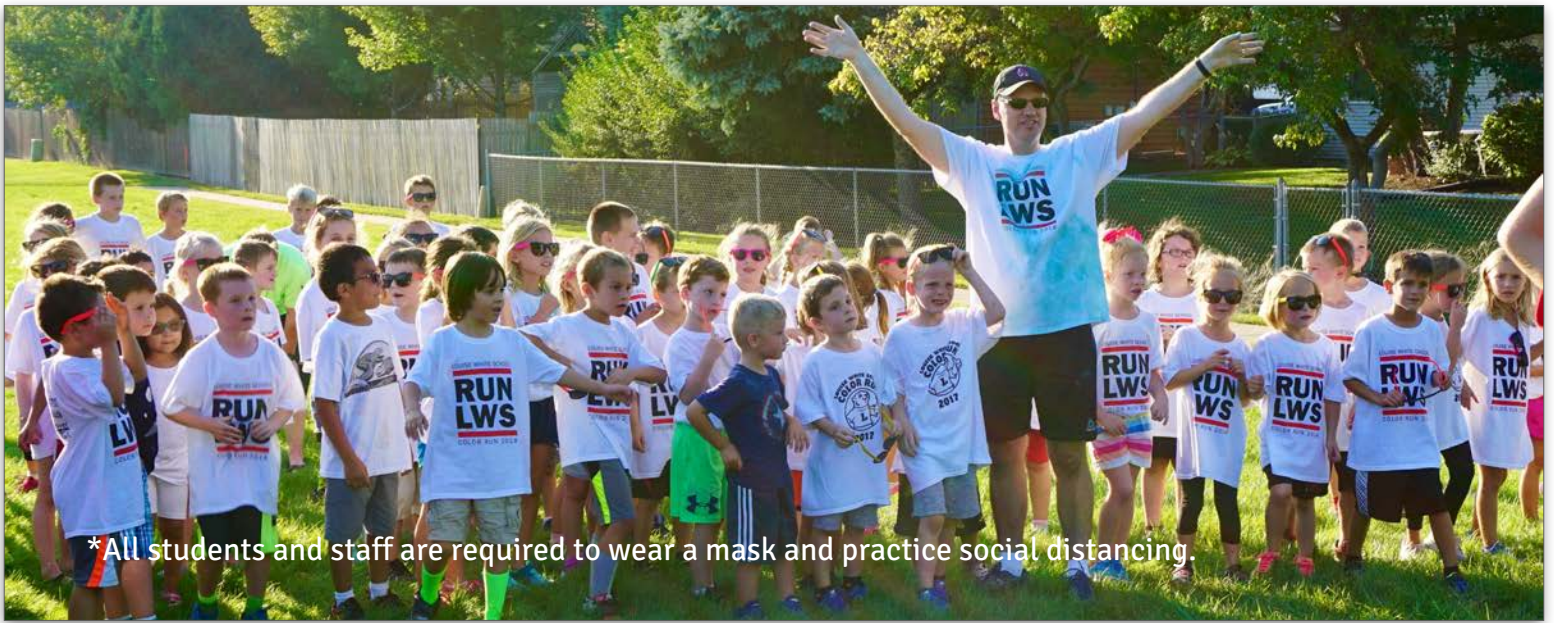
*All students and staff are required to wear a mask and practice social distancing.