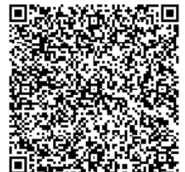
Robotics Season Info Meetings