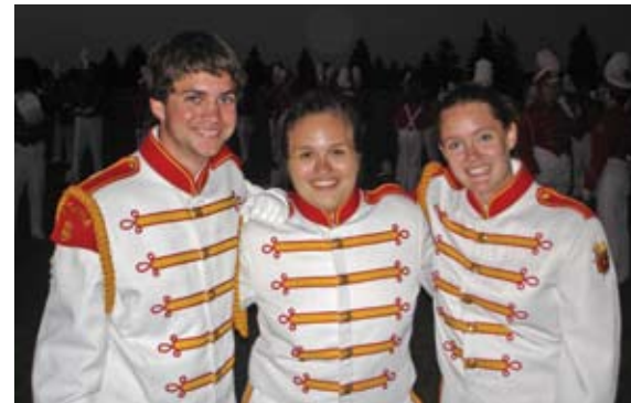
Students excited for band

Judging from the pride that Batavia students have in their marching band, it sounds like the program is off on the right foot!