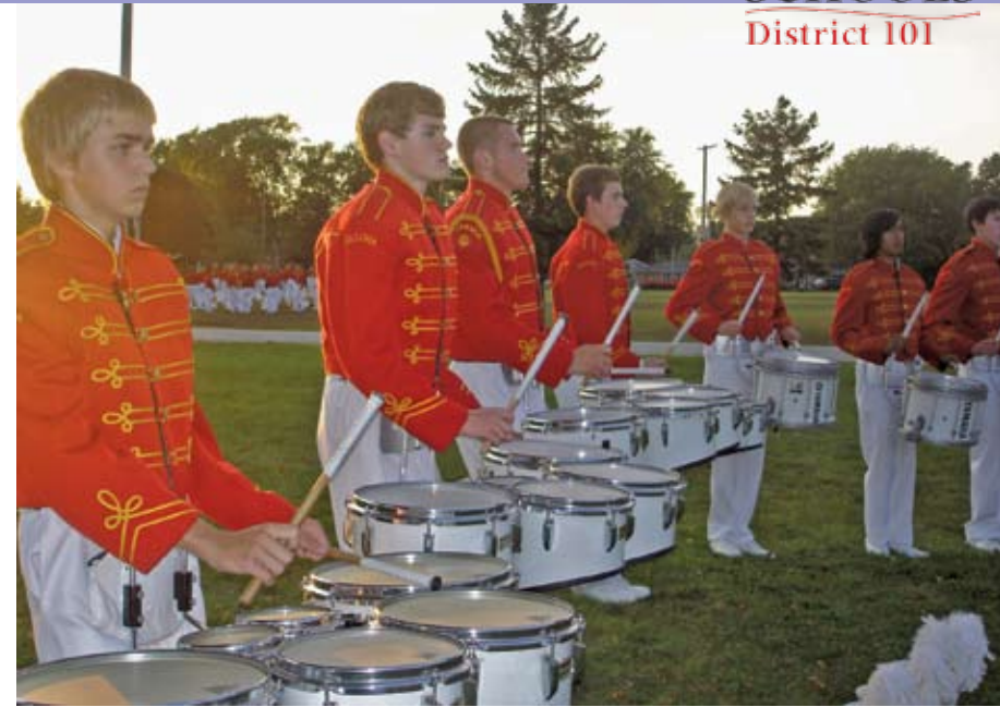
Drum line rocking it out

The new model has allowed the group to focus on a marching band show that is developed, rehearsed, and refined throughout the fall marching band season. This year's show is entitled "The Music of