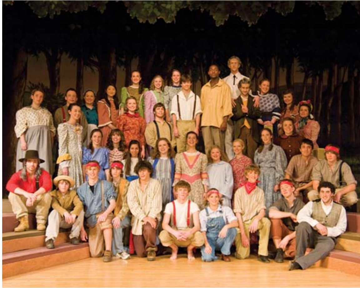
The cast of "Big River"